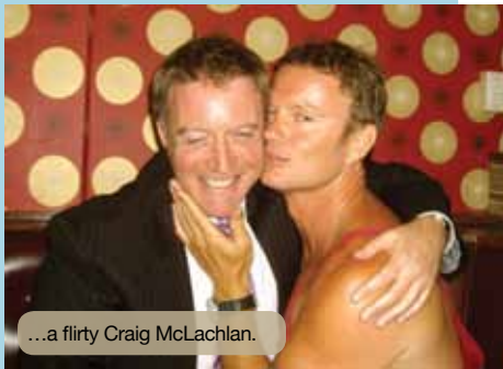
...a flirtious Craig McLachlan.