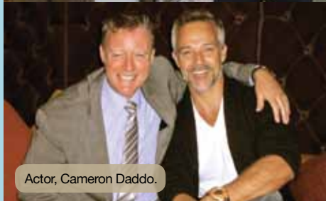
Actor, Cameron Daddo.