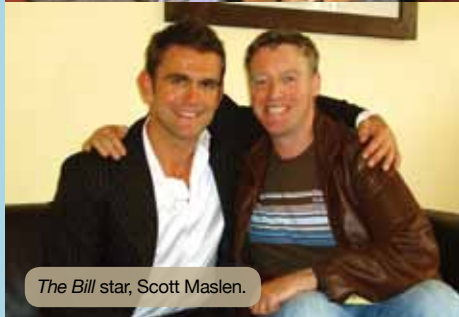
The Bill star, Scott Maslen.