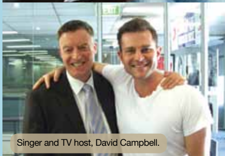
Singer and TV host, David Campbell.