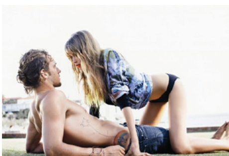
(Above) Tyler's back on the cover of Vogue ; (below) with Paris Hilton in 2006.