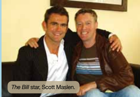
The Bill star, Scott Maslen.