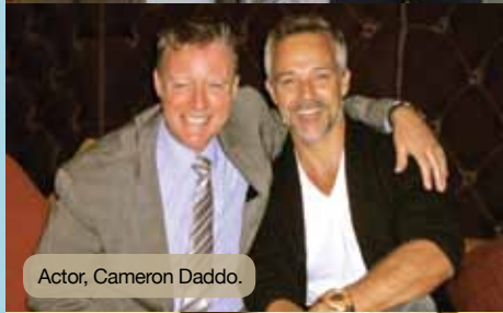
Actor, Cameron Daddo.