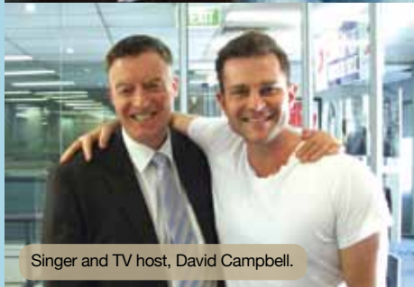
Singer and TV host, David Campbell.