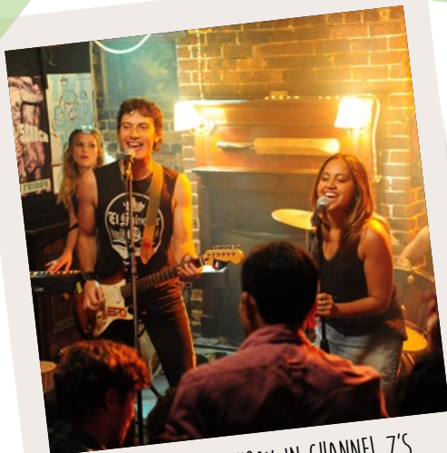
JR AND JESSICA MAUBOY IN CHANNEL 7'S THE SECRET DAUGHTER.

I've had a night or two at Arc where I've definitely been hit on, which is always a big compliment. That was more in my younger years. Now when I go out I think I have that "dad" energy. It's only been four months but I think I'm already like it.