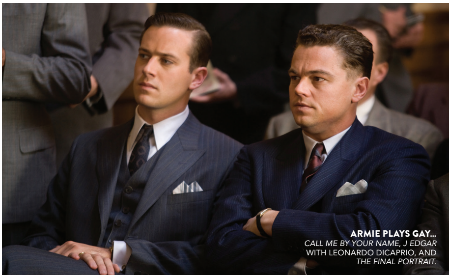
ARMIE PLAYS GAY... CALL ME BY YOUR NAME, J EDGAR WITH LEONARDO DICAPRIO, AND THE FINAL PORTRAIT.

His risk-taking and the acclaim for Call Me By Your Name has propelled Hammer to the top of the