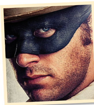
LEADING MAN (ABOVE) THE LONE RANGER AND MIRROR MIRROR. (LEFT) THE MAN FROM U.N.C.L.E. WITH HENRY CAVILL.

leading man heap, beating out rivals Chris Pratt and Channing Tatum in recent industry polls.