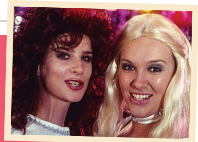
RACHEL GRIFFITHS AND TONI COLLETTE IN THE 1994 FILM.