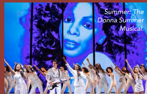
Summer: The Donna Summer Musical .

“ Summer's issues with the gay community, suicide attempt and becoming a born-again Christian are glossed over.