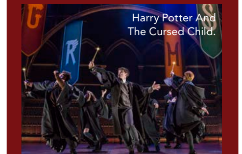
Harry Potter And The Cursed Child.