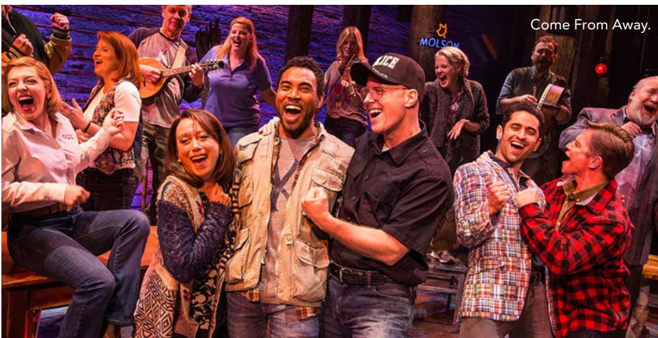
Come From Away.