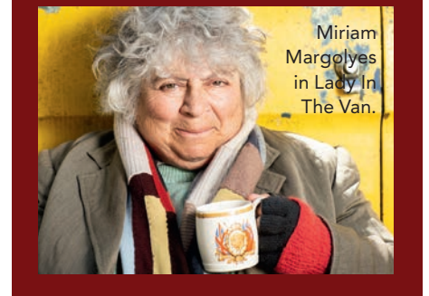
Miriam Margolyes in Lady In The Van.