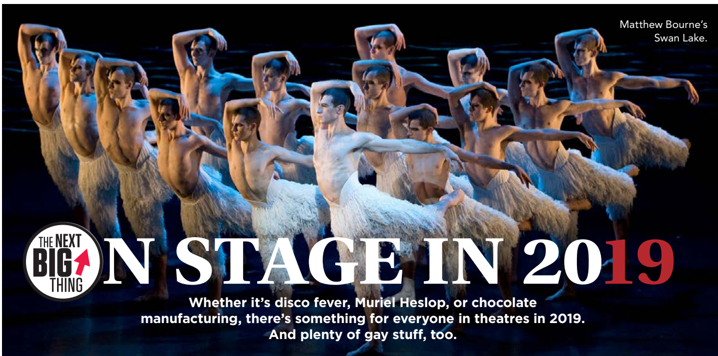
Matthew Bourne's Swan Lake.