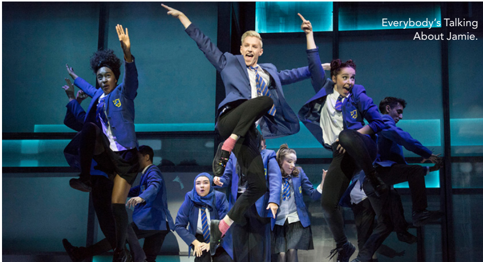
Everybody's Talking About Jamie.

to the stage with a score written by, of course, Dolly Parton.