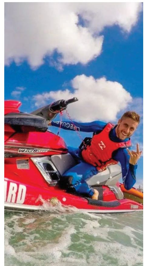
By Matt Myers

At night I'm a freeballer for sure, no question. But during the day it's fitted boxers!