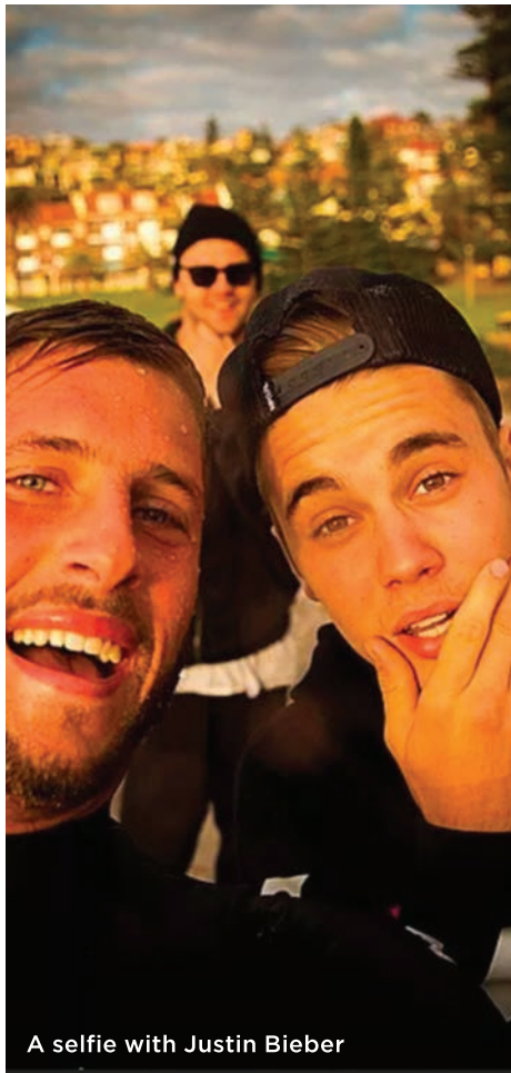
A selfie with Justin Bieber